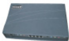
IK-180 Teacher External Box