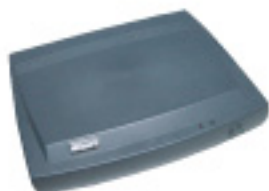
IK-288 Data Repeater 8 port repeater Each port can connect to 5 students External Boxes