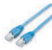
CAT5E STP Cable Connect all HiClass V components together Standard STP LAN Cable