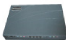
IK-2200 2 port Student External Box Support 2 student PCs