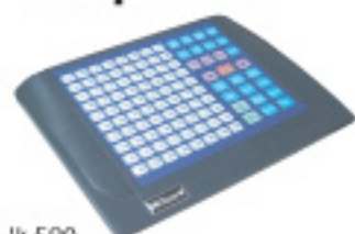
IK-590 Teacher Control Panel 26 function buttons 80 student buttons LED indicators