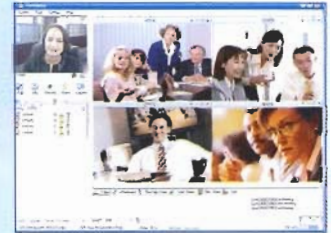
Himeeting - Multi Video Screens