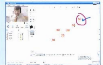
Himeeting - Digital Whiteboard