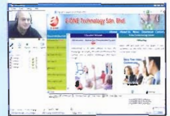
Himeeting - Screen Sharing